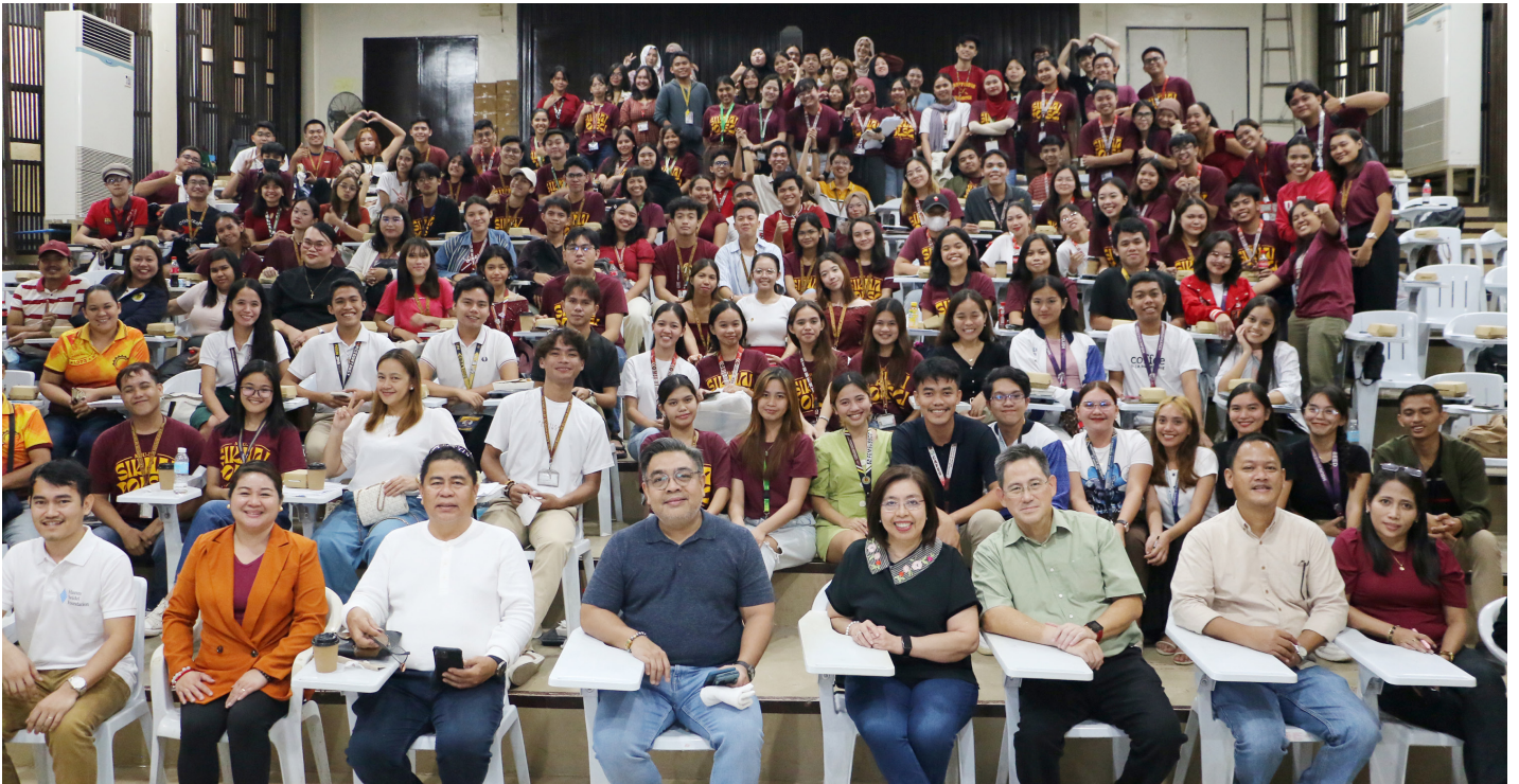
Federalism talks gain momentum in Iligan City. In a bid to deepen understanding and awareness of federalism, a seminar held at Mindanao State University - Iligan Institute of Technology in Iligan City drew 166 attendees last November 22, 2023.