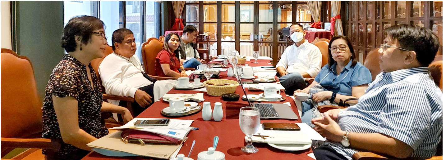
PILG-HSF Core Group Meeting: Moving Forward with Information and Engagement , August 18, 2023, Makati City