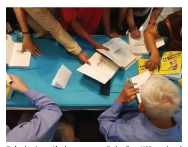
To further intensify the program on Federalism, HSF re-printed the book entittled Federalizing the Philippines: A Primer, for distribution after each forum.

Key to an informed society is the continuation of discussions and exchanges of ideas on federalism in various platforms so the laudable benefits and advantages of a federal form of government would be understood and appreciated by the people.