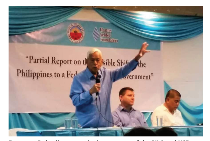
Forum on Federalism, a continuing program of the PILG and HSF to a well-informed the public. The late Senator Nene Pimentel discussed the Draft Bayanihan Federal Constitution at Cagayan de Oro City.