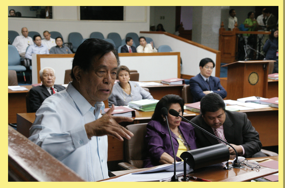
The late former Senator Nene Pimentel during the deliberation of Anti-terrorism bills at the Senate Session Hall, November 10, 2005.

(Excerpt from Nene Pimentel's speech at the Senate November 10, 2005)