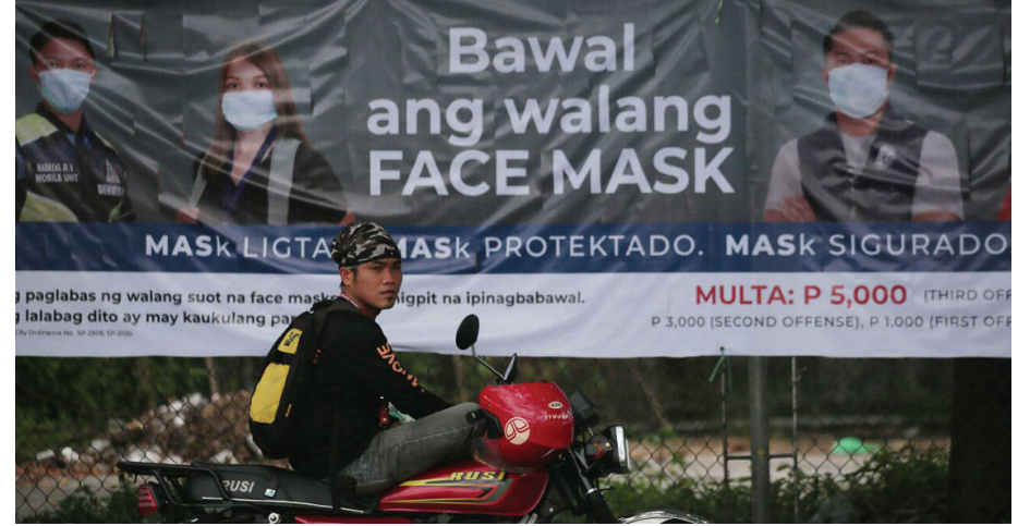
A man rests on his motorcycle parked in front of a public service announcement.

Pimentel Institute for Leadership & Governance Unit 403, Maga Centre, 1016 San Antonio Street, Paseo de Magallanes, Makati City 1232 Telephone No.: 8853-0224 to 25 Email: rcroffice@yahoo.com.ph Website: www.pimentelinstitute.org