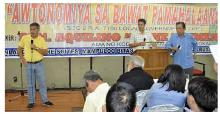
Cabanatuan City Seminar. Some 1200 participants attended. February 25-27, 2011