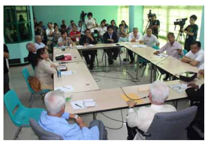
Chair Brillantes (back to camera, white barong) facing inquisitors at the Round Table Conference on Election Problems on May 22.

When the law was passed in 2007, automation of elections were supposed to be only piloted in several selected areas of the country. However, it was implemented all over the country giving rise to the oxymoron that it