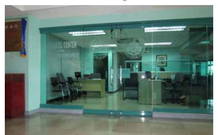
A view of the Pimentel Center located at the 4th Floor at the Administration Building of the University of Makati.

Typhoons Ondoy and Sendong that recently wrought indescribable havoc to places that had been typhoon-free in the past simply made the subject inevitably compelling.