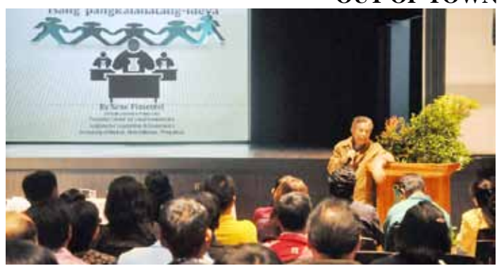
Baguio City Seminar. Some 200 participants attended. November 25-27, 2011