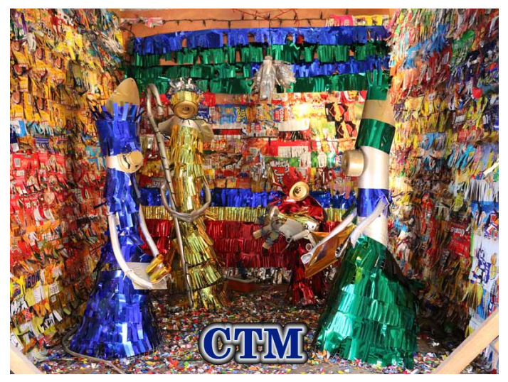
Nativityhan Most Eco Friendly - College of Technology Management.