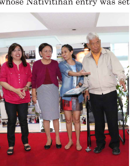
2nd Prize Winner - Center for Broadcast and Digital Arts.

Third place in the Nativitihan contest is the Design Center for National Building (DCNB), whose Nativitihan entry was set