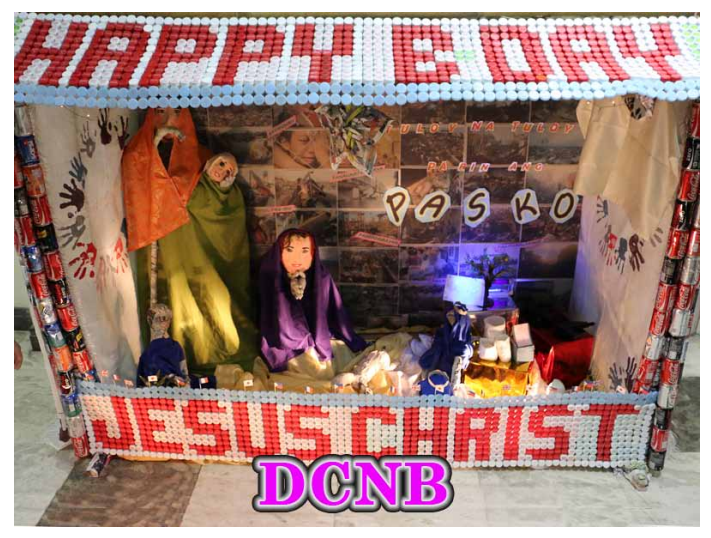
Nativityhan 3rd Prize Winner - Design Center for National Building.