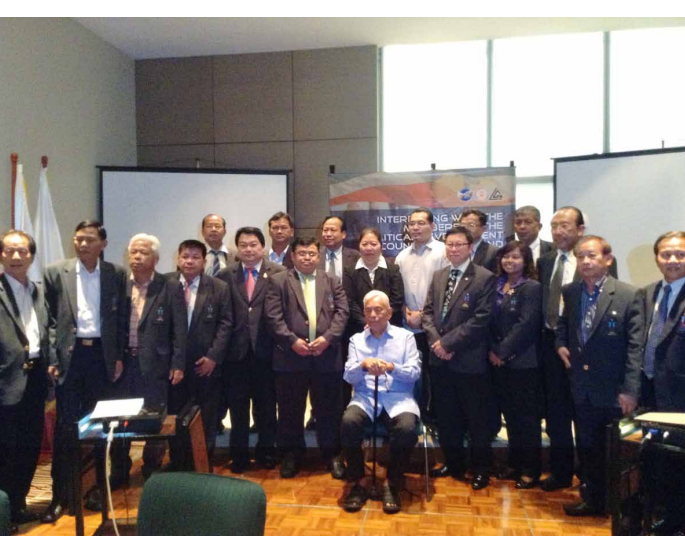
Members and officers of Political Development Council of Thailand pose with Prof Nene Pimentel (July 3).